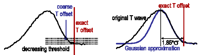
Figure 2. Exact T offset detection. Two independent methods for exact wave boundary calculation were used and averaged: Left: decreasing thresholds for the range curve. Right: Gaussian approximation to the descending T wave.

The signal in between two consecutive QRS